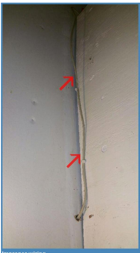
Improper wiring Switches & Fixtures: General:

Switch cover is damaged, needs replacement.