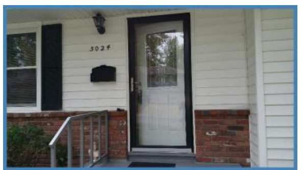
Rear Entry Door: