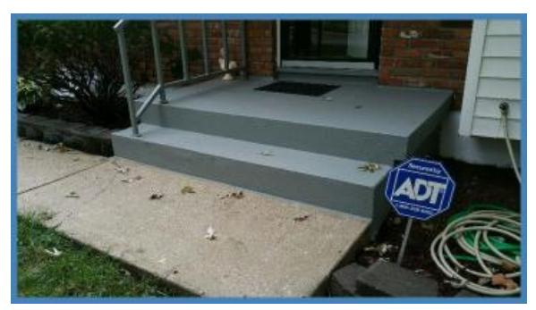
Decks / Balcony: Condition:

Wood, General condition is serviceable, Spindle missing and broken. Repair for safety.