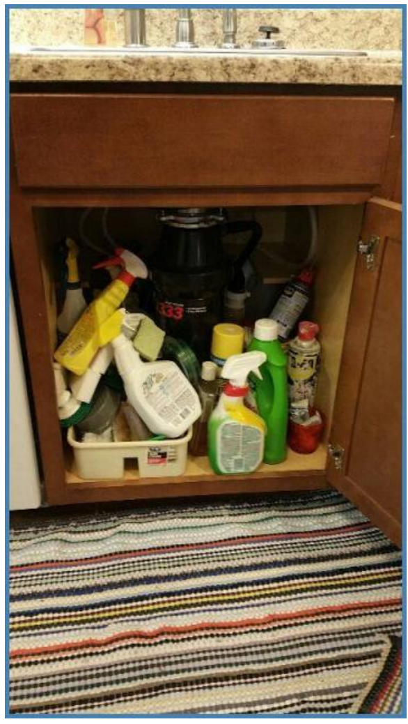
Range/ Cooktop / Oven:Type & Condition:Gas, App