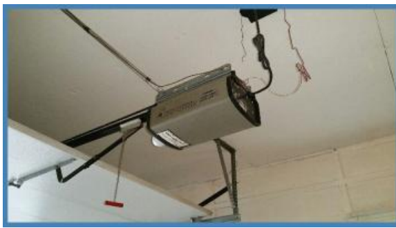
Automatic Opener(s) is/are, operational, Outdated opener. This age units generally do not have modern safety devises. Replacement recommend for safety.