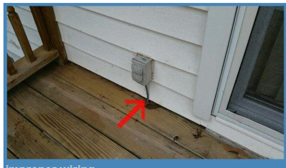
improper wiring Master Bath: