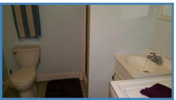
Improper supply plumbing noted. Repair as needed.