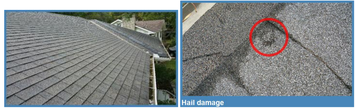
Hail Damage noted to roof surface. Consult qualified roofing contractor to evaluate and repair as needed.