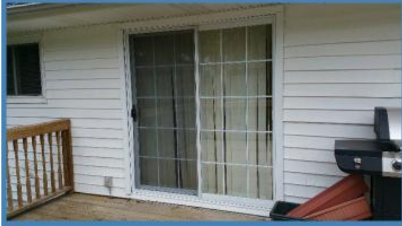
Other Entry Doors:

Wood, panel type door, with glass. Observations- Weather-stripping is only fair and needs renewal. Gaps are noted.